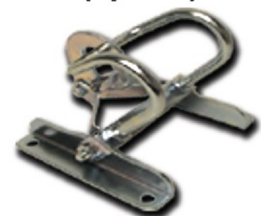
Upper Hook Assy Set