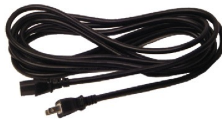
Power Cable Set