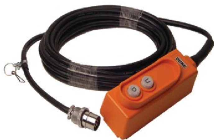
Pendant Control Set